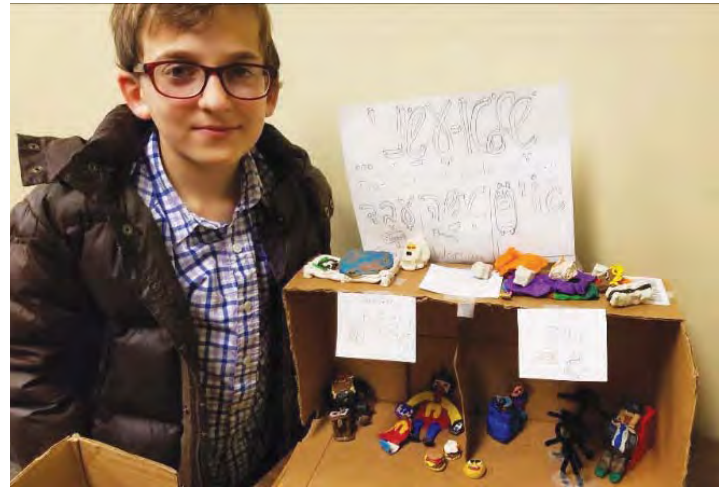
One of the many creative projects depicting Birchos Hashachar , created by the seventh-grade boys at the Hillel Academy of Denver.